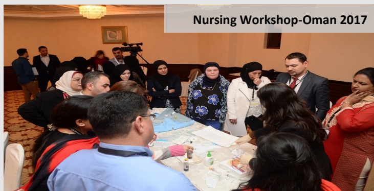
Nursing Workshop-Oman 2017

In collaboration with St Jude, the Registry software is expected to be available in summer 2017. The Registries and Data Management Working Group has been collecting data from all registered centers in POEM Group regarding the available resources for supporting the registry whether technical, human resources and other. Once the registry is ready, a workshop will be held for essential personnel to get the needed training in using the software. It was noted that, for the registry, guidelines for publications will be set, and individual MOUs would be executed for each research project for participating centers.